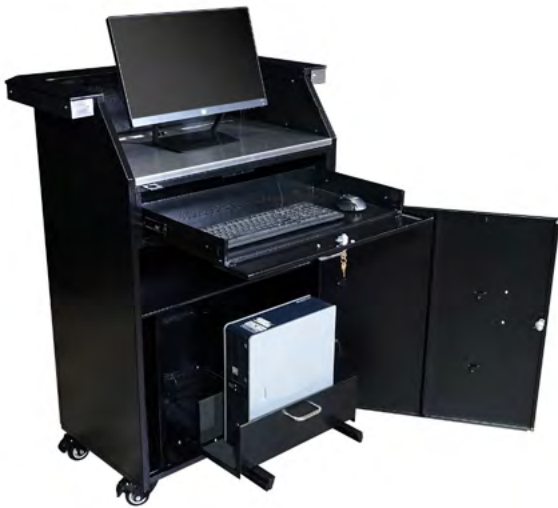
DELUXE PODIUM with keyboard & PC trays

The Security Station was borne out of requests from The Valet Spot clients to customize our existing podiums with the specific needs of the security industry. We are now becoming the fastest growing producer of durable and cost-effective security podiums and desks in the US.