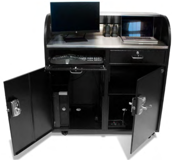
PORTABLE PROFESSIONAL DESK