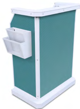
DELUXE STAND White Frame, Laminated Panels, & Tiered Menu Holder