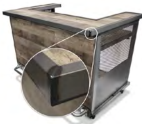
DISTRESSED HEAVY-DUTY BAR

These models are available with clear coat frames so you can see the unique distressed steel for a rustic look that patinas over time.