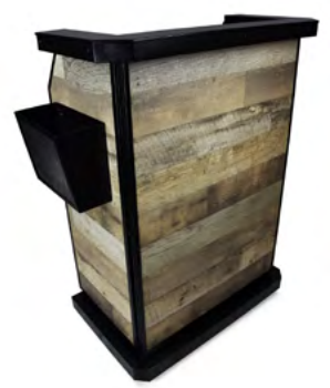
DELUXE STAND Black Frame, Laminated Panels, & Menu Holder