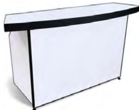
PROFESSIONAL BAR CURVED COUNTER