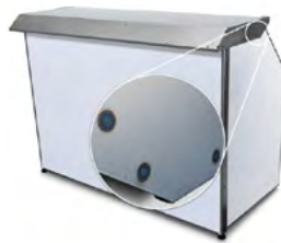
RUSTIC PROFESSIONAL BAR