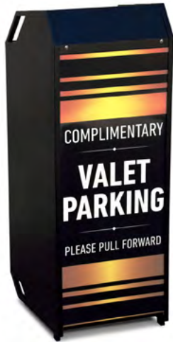
COMPACT PODIUM with custom signage on Acrylic panel

The Valet Spot is the leading supplier of innovative and high-quality valet parking equipment in the world. Our products keep keys secure and organized at restaurants, hospitals, casinos, car dealerships, airports, and hotels worldwide.