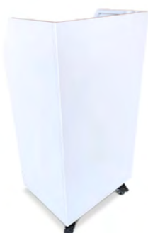
WHITE STANDARD PODIUM