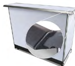
RUSTIC STANDARD BAR