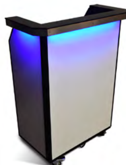
CUSTOM DELUXE PODIUM