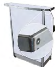
RUSTIC COMPACT BAR

* All bars are shown with white acrylic panels. There are 800+ custom panel options available including LED lighting, wood laminates, and custom printing for branding