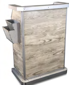
DELUXE STAND Rustic Frame, Laminated Panels, & Tiered Menu Holder