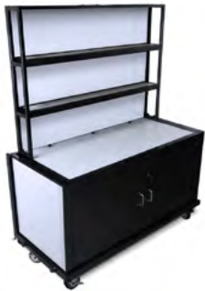
FOLD & ROLL BACK BAR

These models are available with black or white powder coat frames for a tailored uniformed look.