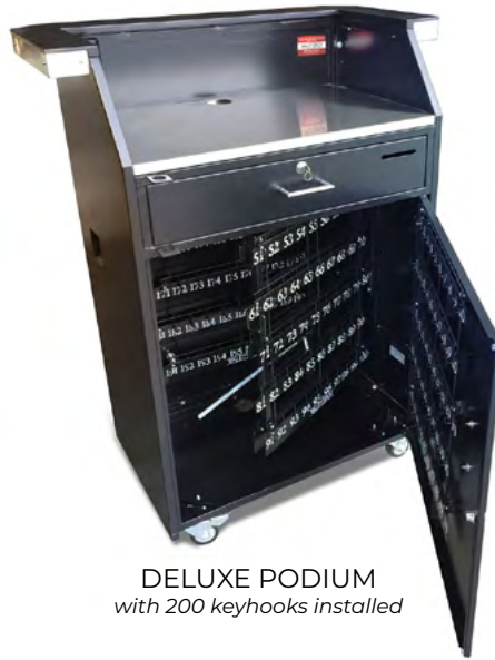
DELUXE PODIUM with 200 keyhooks installed